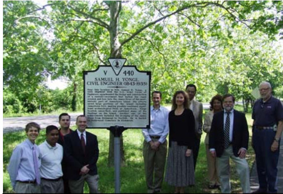
The highway marker, through a SPAG grant, shown above is located beside Pocahontas' marker on Jamestown Road, within site of the Jamestown Settlement Museum.

Imagine if some of the United States most historical artifacts had never been discovered –we wouldn't have the wealth of knowledge about the beginnings of its rich heritage. At Jamestown, VA, one of the most historical birthplaces of the USA, we have a man by the name of Samuel H. Yonge to thank for the many continued discoveries in the area.